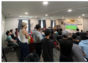
The Guy's enjoyed a Saturday night movie and Soccer on Sunday!