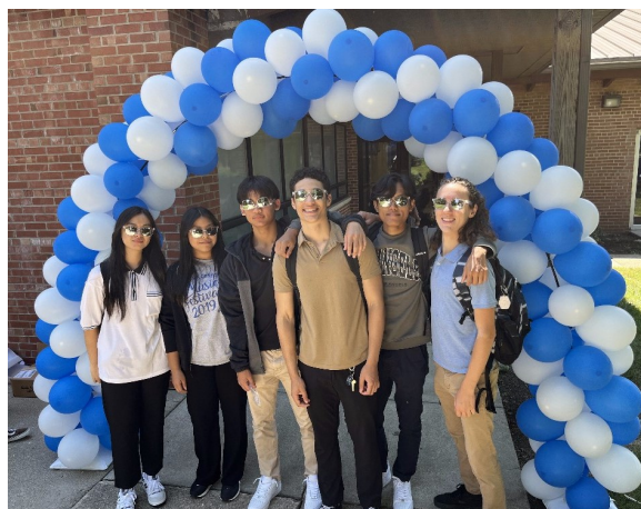
Welcome to Indiana Academy New and Old Friends