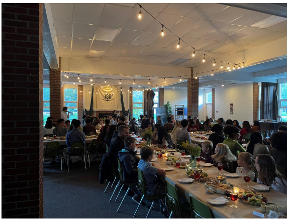
Week of Prayer ended with Communion and an Agape Feast.