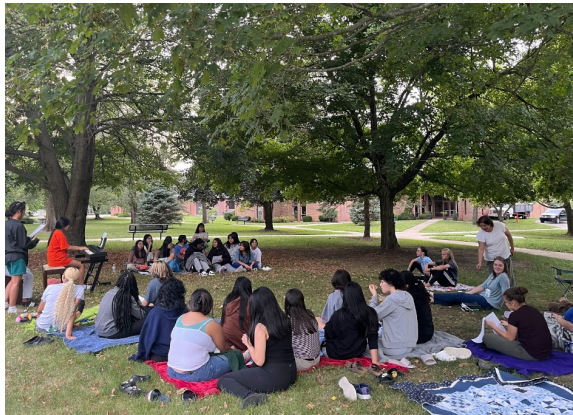
The Girl's enjoyed Sabbath service and fellowship in the outdoors.