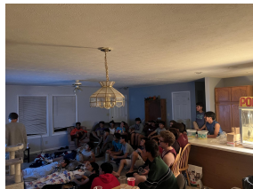
The RA's prepared and presented the Sabbath Service.