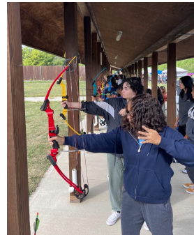
The Girl's had the opportunity to learn archery and painting Inspirational Rocks to place around Campus.